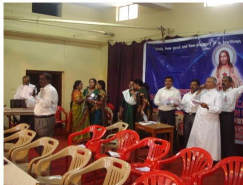
Praise Jesus Ministry Animator