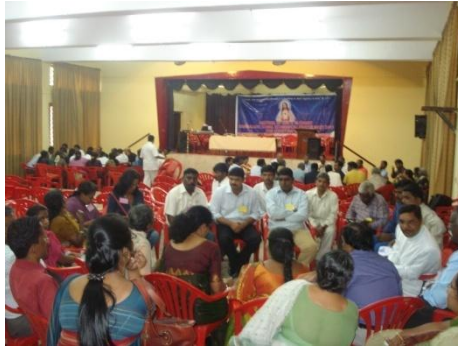
180 Christians leaders of various denominations in great cheer