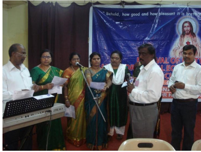
Group wise attempt for oneness